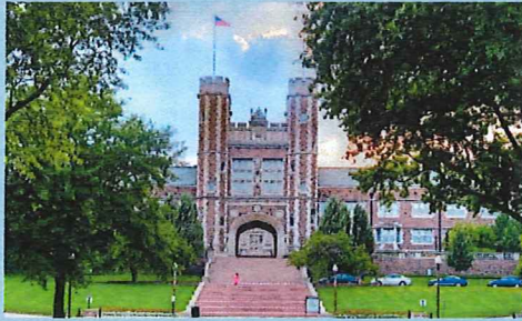
Washington University in St. Louis