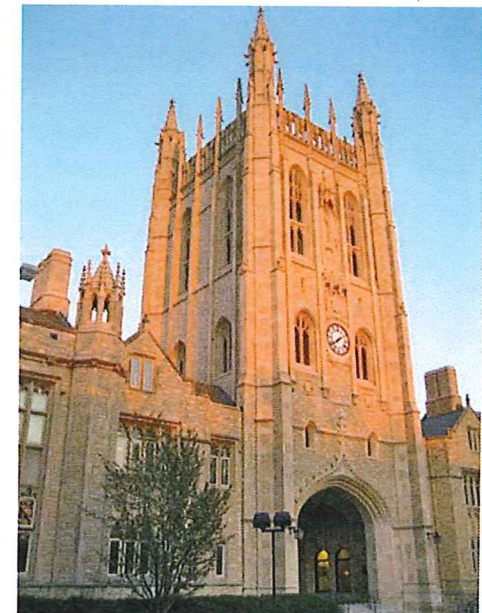
University of Missouri-Columbia

Six hundred twenty two Hagan Scholars from 37 states currently attend 236 colleges and universities.