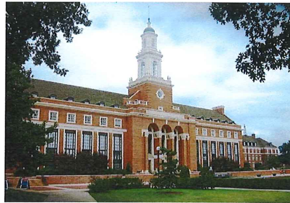
Oklahoma State University